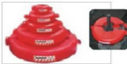
GATE VALVE LOCKOUT