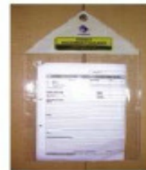
BOOKLET / PERMIT HOLDERS