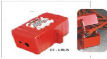
PLUG LOCKOUT BOX