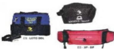
LOCKOUT SAFETY BAGS