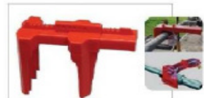
SETTABLE BALL VALVE LOCKOUT