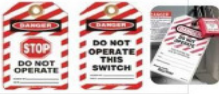
STANDARD SAFETY LOCKOUT TAGS