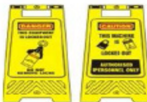
LOCKOUT INFORMATION STANDS