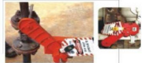
SETTABLE BALL VALVE LOCKOUT