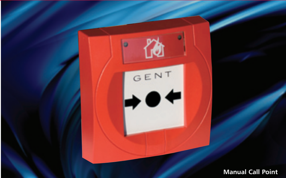
Manual Call Point